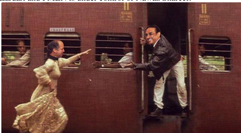
#AzadiMarch #TrainToChina #DDLJ, August 2014.

The third meme is based on political scenerion of Pakistan where there is race of power among three major parties: PTI,PPP and PMLN.The PTI is led byImran Khan, PPP is controlled by Asif Ali Zardari and PMLN is under control of Nawaz Shareef.